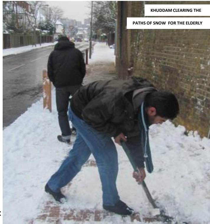
KHUDDAM CLEARING THE

This verse shows that the reward for those who strive in good works will be a huge return in benefit and personal pleasure which will be given to us in this life and the next. We should all Pray that we can serve Islam, Ahmadiyyat and our Nation with our body and mind to invoke the pleasure of Allah as He sees everything we do.