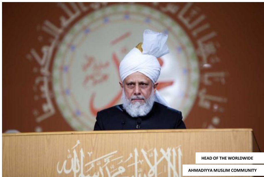
HEAD OF THE WORLDWIDE

[Extract from the summary of the Sermon delivered by Huzur أيده الله تعالى بنصره العزیز on the 9 th of September 2011]