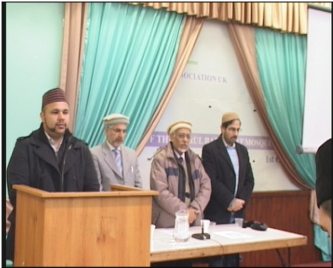
(From Right to Left)