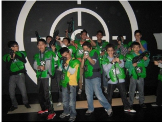
Atfal enjoying the world of Laser Quest

Alhamdulillah, by the Grace and Mercy of Allah, on 29th December 2011, Ma-